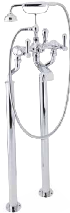
Floor mounted, with handshower.

Chrome – SH5080CP | English Bronze – SH5080BZ Gold – SH5080IG | Nickel – SH5080NI | Pewter – SH5080PF Polished Brass – SH5080BR | Satin Brass – SH5080SB