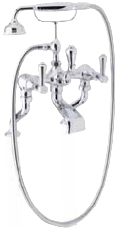
Deck mounted, with handshower.

Chrome – SH5080CP | English Bronze – SH5080BZ Gold – SH5080IG | Nickel – SH5080NI | Pewter – SH5080PF Polished Brass – SH5080BR | Satin Brass – SH5080SB