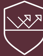
DIRT & STAIN RESISTANT