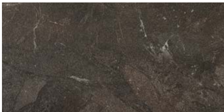
MARRÓN Abujardado / Bush-hammered